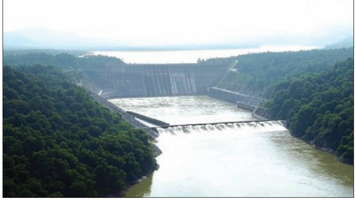
disaster prevention and relief for the benefit of the people by the river," she said. She said China's hydropower development in the lower reaches of the Yarlung Zangbo River aims to speed up the development of clean energy and respond to climate change and extreme hydrological disasters. China on Wednesday approved the construction of the world's largest dam, stated to be the planet's biggest infra project on the Brahmaputra River in Tibet close to the Indian border, raising concerns in India and Bangladesh. The hydropower project will be built in the lower reaches of the Yarlung Zangbo River, the Tibetan name for the Brahmaputra River, an official statement here said. The dam will be built at a huge gorge in the Himalayan reaches where the Brahmaputra River makes a huge U-turn to flow into Arunachal Pradesh and then to Bangladesh. Mao said China's hydropower development in the lower reaches of the Yarlung Zangbo River aims to speed up the development of (CONTD. ON PAGE-2)

BEIJING, Dec 27: China on Friday defended its plan to build the world's largest dam on the Brahmaputra River in Tibet, saying the project will not "negatively affect" lower riparian states and that safety issues have been addressed through decades of studies. Chinese Foreign ministry spokesperson Mao Ning played down apprehensions about the massive project to dam the Brahmaputra River, which is called Yarlung Zangbo in Tibet. The project estimated to cost around USD 137 billion is located in the ecologically fragile Himalayan region, along a tectonic plate boundary where earthquakes occur frequently. Mao said China carried out in-depth studies for decades and took safeguard measures. China has always been responsible for the development of cross-border rivers, Mao told a media briefing here in response to a question on the concerns related to the dam. She said the hydropower development there has been studied in depth for decades, and safeguard measures have been taken to ensure the project's security and ecological environment protection. "The project will not negatively affect the lower reaches," she said referring to the concerns in India and Bangladesh which are the lower riparian states. "China will continue to maintain communication with countries at the lower reaches through existing channels and step up cooperation on