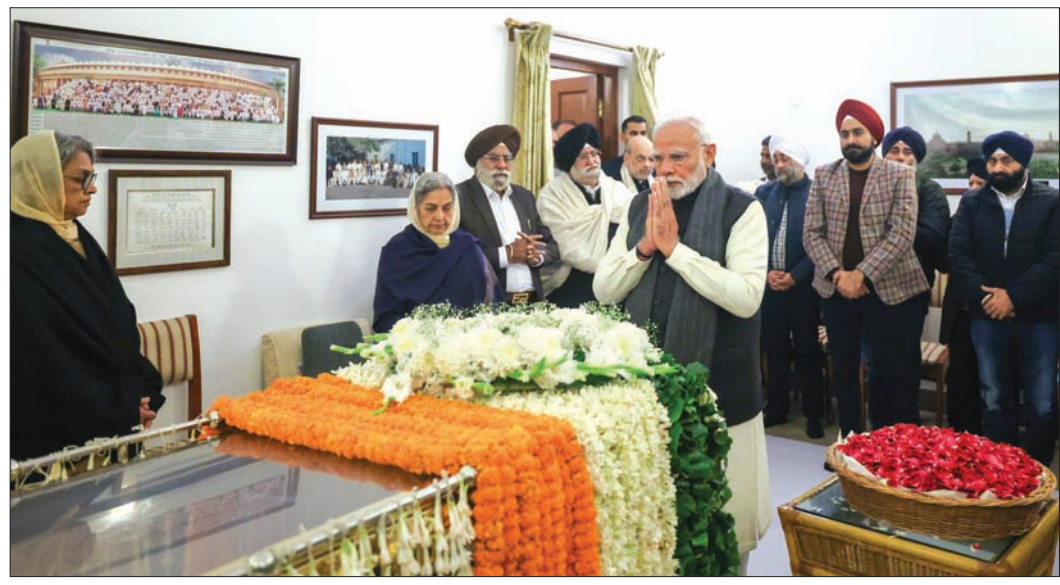
In a video message, Modi recalled Singh's life journey after his family migrated to India following Partition and noted that he left everything behind but his numerous achievements since then were no mean feat. Singh, the architect of India's economic reforms and a consensus builder in the rough world of politics, died at AIIMS, Delhi, late on Thursday. He was 92. He is survived by his wife and three daughters.

NEW DELHI, Dec 27: President Droupadi Murmu, Vice President Jagdeep Dhankhar and Prime Minister Narendra Modi were among the top dignitaries who paid homage to former prime minister Manmohan Singh at his residence here on Friday. Several leaders cutting across party lines, including Union ministers and Congress leaders Sonia Gandhi, Mallikarjun Kharge and Rahul Gandhi, also paid their tributes to the former two-term prime minister who died on Thursday night. President Murmu and Vice President Dhankhar visited the residence of Singh and paid their last respects to him and met his wife and other family members. Prime Minister Modi, who also laid a wreath, described his predecessor's death as a big loss to the nation, asserting that his commitment to the people and for the country's development would always be respected.