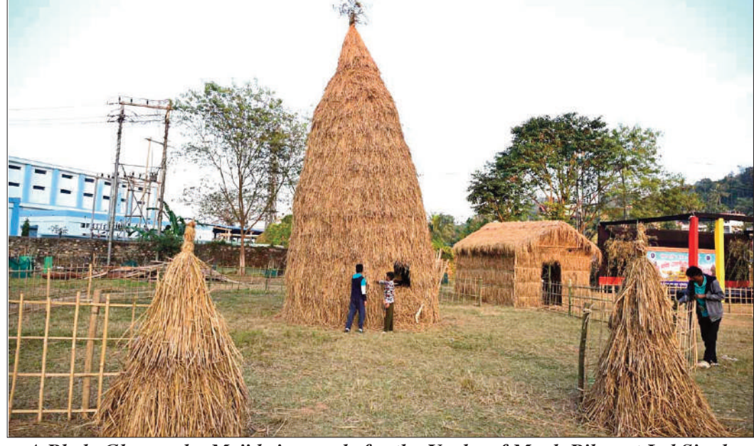
A Bhela Ghar and a Meji being made for the Uruka of Magh Bihu, at Lal Singh Academy, Kharguli in Guwahati on Saturday.