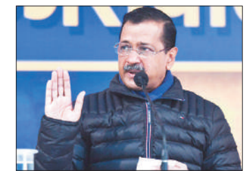
moved by the agency through the Delhi LG, they said.

The ministry is the competent authority to okay such a request