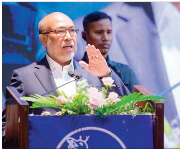
in the state, he said. "Chief Minister-gi Hakshelgi Tengbang (chief minister's health assistance) was launched on January 21, 2018, by the government after considering the hardships faced by the poor

IMPHAL, Jan 8: Manipur Chief Minister N Biren Singh on Wednesday said that around 500 youth from the state shall be provided skill training in Delhi for cabin crew placements in airlines and priority will be given to internally displaced persons (IDPs). Addressing a programme here, Singh said that the training will be funded by the ministry of tourism. He said 17 startups have already employed around 432 IDPs. Asserting that the government has been extending all possible assistance in shifting people affected by the ethnic conflict to safer places, Singh said, "In Phubala area in Bishnupur district, prefabricated houses have been constructed by the government. People have been moved to houses located at a safer place. So far, around 2,500 prefabricated houses have been occupied." Speaking about various schemes