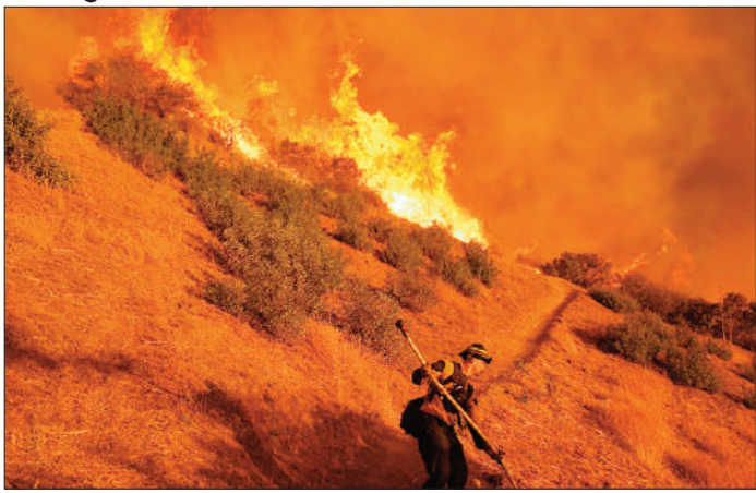
refuge in nine shelters.