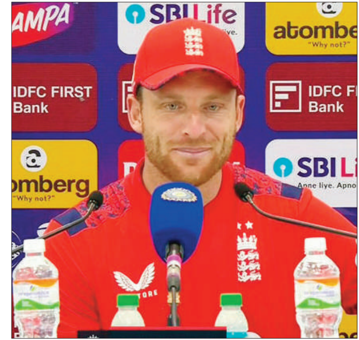
the imposing left-hander, who has also dabbled in coaching, said his