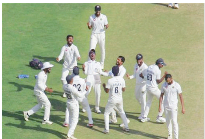
AHMEDABAD, Feb 21: A resilient Kerala on Friday sealed their maiden Ranji Trophy final by taking a dramatic two-run first-innings lead over Gujarat, 68 years after making their debut in Indian cricket's premier domestic competition.

Going into the final day at 429/7, the home side, who won the Ranji title in 2016-17, needed just 29 runs to take a first innings lead.