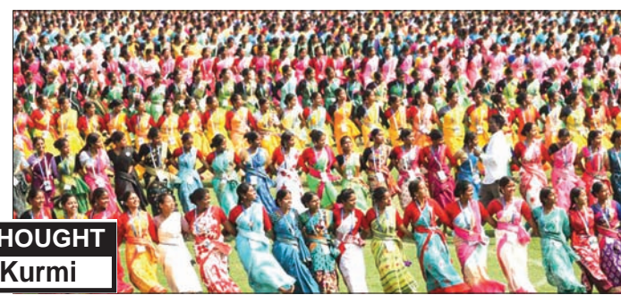
DEGREE OF THOUGHT By: Dipak Kurmi

The upcoming grand recital, which will feature more than 8,000 dancers from across Assam, is not only an effort to set a Guinness World Record but also an initiative to bring global attention to the tea