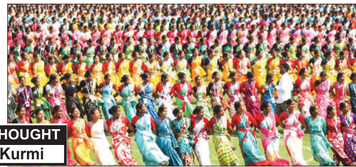
DEGREE OF THOUGHT By: Dipak Kurmi

The upcoming grand recital, which will feature more than 8,000 dancers from across Assam, is not only an effort to set a Guinness World Record but also an initiative to bring global attention to the tea