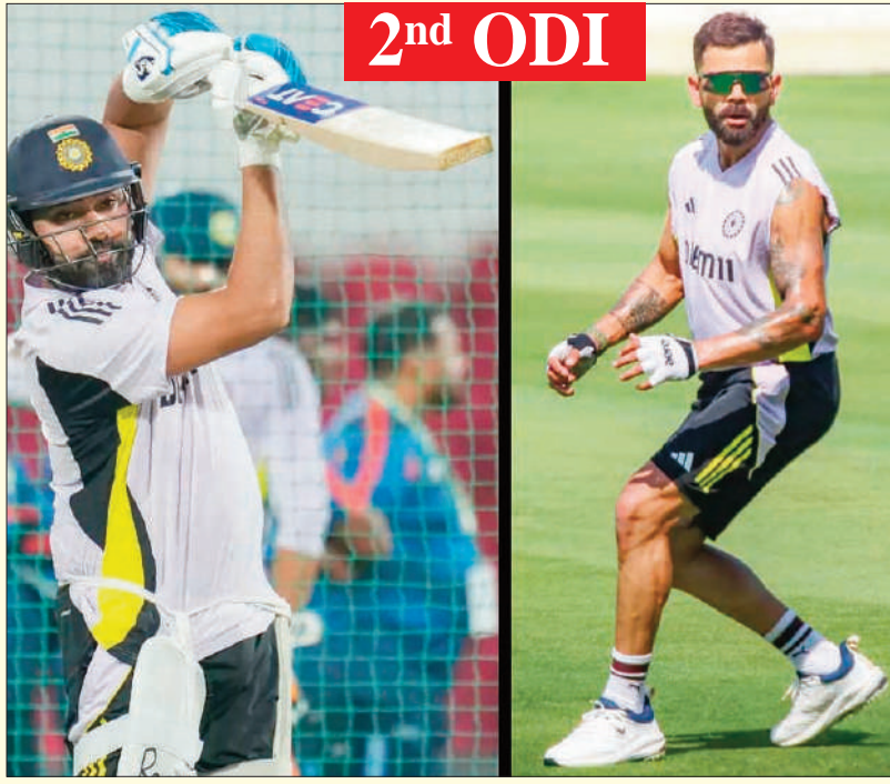
CUTTACK, Feb 8: The barren run of skipper Rohit Sharma and the selection conundrum that Virat Kohli's pos-

sible return poses are the towering obstacles in India's quest for a series win against England in the second ODI