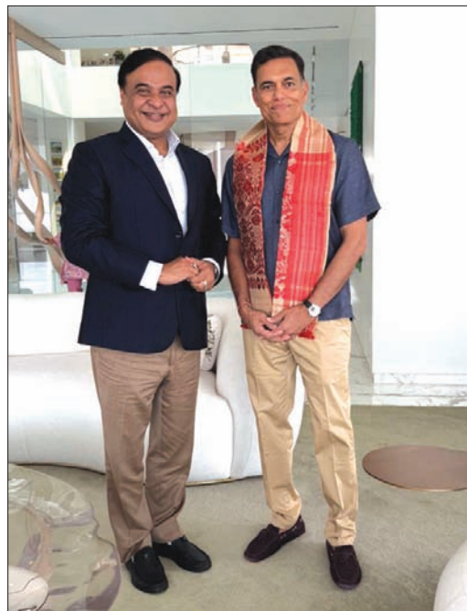
Solar and Bio-CNG to Green Hydrogen and ATJ fuel, new investment opportunities are emerging very fast and thick in Assam. (CONTD. ON PAGE-2)

Further drawing attention to Assam's green energy revolution, the chief minister stated that from Floating