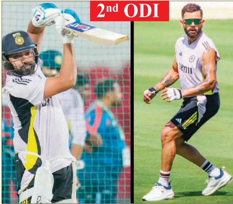
CUTTACK, Feb 8: The barren run of skipper Rohit Sharma and the selection conundrum that Virat Kohli's position poses are the towering obstacles in India's quest for a series win against England in the second ODI

here on Sunday. India had taken a 1-0 lead after their four-wicket win at Nagpur, but Kohli getting rested owing to a "sore right knee" had raised concerns about his fitness ahead of the Champions Trophy later this month. However, vice-captain Shubman Gill had indicated that Kohli could be back for the second match, which will be played at a venue where the latter made a match-winning 85 against the West Indies in 2019. Kohli had also travelled to Cuttack along with his teammates and he looked relaxed. The Indian team will certainly welcome that sign, but it also raises a challenge in terms of selection. Shreyas Iyer, who came in for Kohli at the last minute by his own admission, made a rollicking 36-ball 59 that has made dropping him an almost unthinkable act. If the past norms are followed, then Kohli will walk in for Shreyas, but it is more likely that Yashasvi Jaiswal could be the one who will have to make for the batting icon. It means that Gill might rejoin Rohit at the top, and Jaiswal did not have a