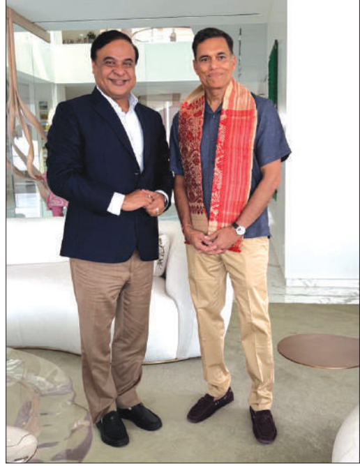
Solar and Bio-CNG to Green Hydrogen and ATJ fuel, new investment opportunities are emerging very fast and thick in Assam. (CONTD. ON PAGE-2)

GUWAHATI, Feb 8: Chief Minister Himanta Biswa Sarma on Saturday met the leading industrialists in Mumbai and invited them to Advantage Assam 2.0. "As a part of a series of initiatives of making the forthcoming Advantage Assam 2.0 Investment and Infrastructure Summit a success with meaningful presence of leading industrialists and investors from across the country and outside, Chief Minister Dr Himanta Biswa Sarma today met Chairman JSW Group Sajjan Jindal in Mumbai and invited him to the summit," said an official statement. During the meeting with Jindal, Sarma spoke on issues especially on the scope and potential of partnering together, particularly in infrastructure and energy sectors. The chief minister apprised him of the Assam government intention to encourage increased investment in creating a host of opportunities. "He also (Sarma) said that his government has already initiated steps to strengthen the ecosystem for major investment as well as startups, paving the way for a prosperous future," the statement added. Sarma further informed that the JSW chairman that his government recently has approved the Assam Startup and Innovation Policy to provide various fiscal and non-fiscal incentives to encourage entrepreneurs as the government aims to support 5,000 startups and create one lakh job opportunities in the next five years. Further drawing attention to Assam's green energy revolution, the chief minister stated that from Floating