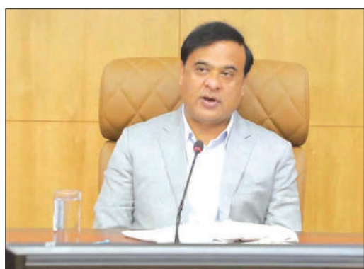
Activities (Prevention) Act or UAPA.