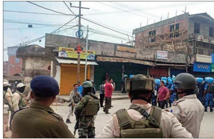
In a joint appeal, the two bodies said, "The Hmar Inpui and the Zomi Council call upon the public to calm down and desist from disrupting normal life in the town."

"The Hmar Inpui and Zomi Council have jointly agreed to lift the shutdown and end all activities, which disrupt normal life in Churachandpur district, with immediate effect," an official said.