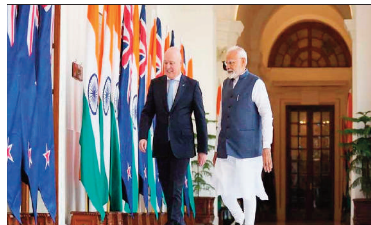
By: Dipak Kurmi

At the gracious invitation of Prime Minister Narendra Modi, the Prime Minister of New Zealand, Rt Hon Christopher Luxon, embarked on his first official visit to India from March 16 to 20, 2025. This momentous visit saw the two nations engaging in high-level discussions across a spectrum of domains, ranging from trade and investment to defense and security, science and technology, and cultural cooperation. Accompanied by a distinguished delegation, including ministers Louise Upston, Mark Mitchell, and Todd McClay, Prime Minister Luxon's visit underscored the mutual commitment of India and New Zealand to further cement their partnership.