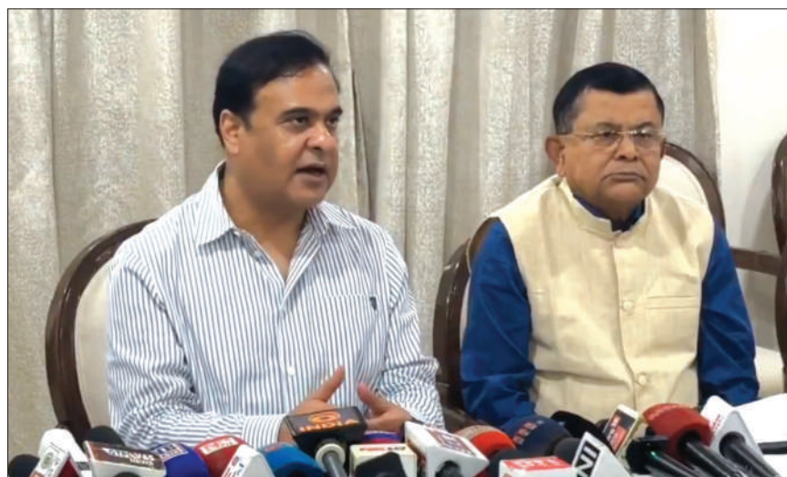
Guwahati, Dibrugarh and Silchar," said Sarma while addressing a press conference here.

"Today, in a cabinet meeting we have taken a decision to allow shops and business establishments to operate 24 hours a day in