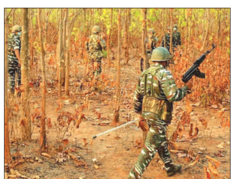
personnel was out on an anti-Naxalite operation in Gangaloor police station area in Bijapur.

An official said a gunfight broke out around 7 am in a forest along the border of Bijapur and Dantewada districts when a joint team of security