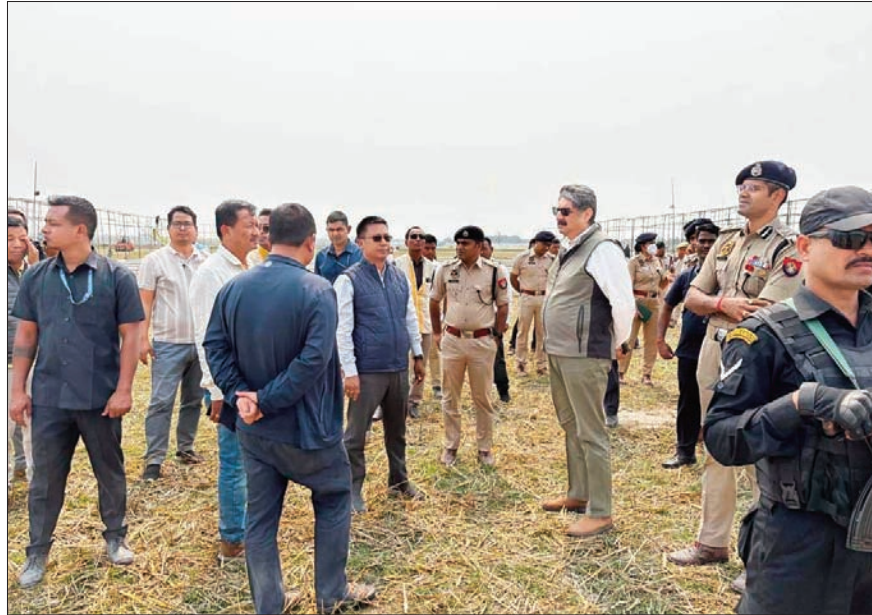
ister Amit Shah and Assam chief minister Himanta Biswa Sarma are expected to attend the open session. Several 20 sub-committees of the confer-

ences are involved in the conference's preparation and arrangements to meet a smooth successful of the conference.