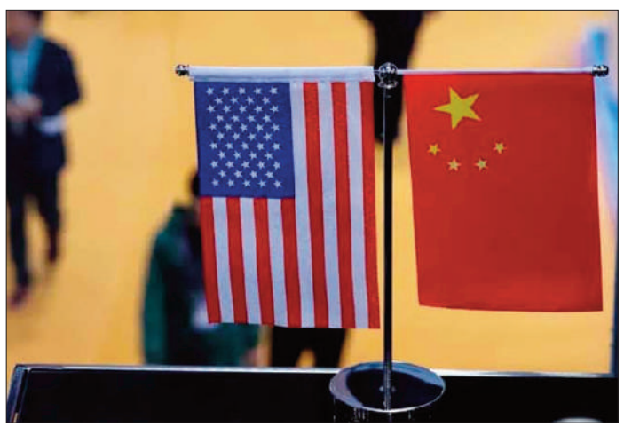
China's heavy tariffs left China

China's new tariffs of 125 per cent against US imports will be ef-