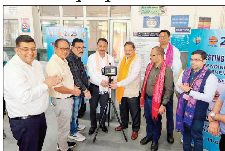
Earlier, the refinery had also contributed three TRUNAT machines over to strengthen diagnostic capabilities.

As part of the initiative, Bongaigaon Refinery has provided two ultra-portable, high-tech X-ray machines to enable early TB detection in remote and underserved areas. Additionally, two CBNAAT machines, crucial for identifying Multi-Drug Resistant TB (MDR-TB), were handed