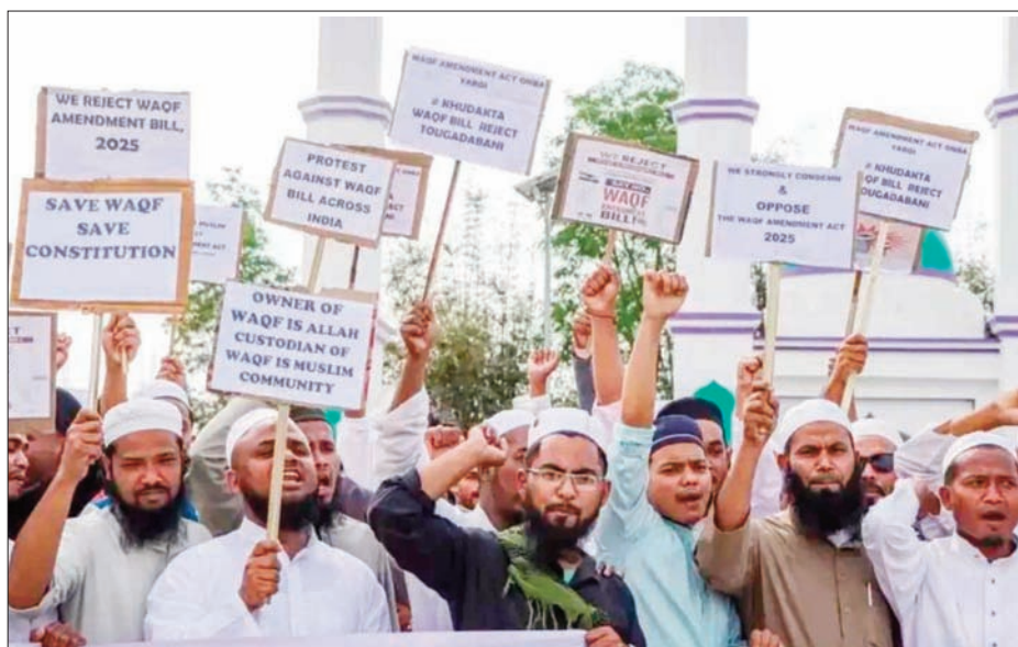
IMPHAL, April 11: Thousands of Muslim protesters on Friday took out rallies in parts of Manipur's Imphal against the Waqf (Amendment) Act, demanding immediate repeal of the law.