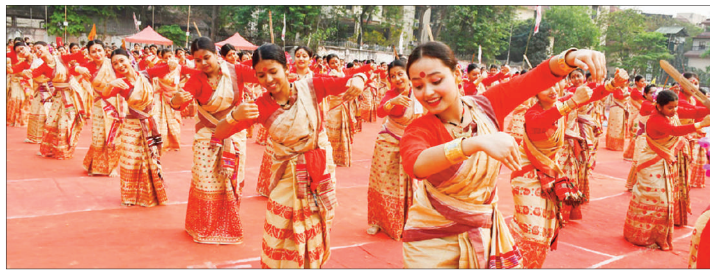
Female dancers participating in closing ceremony of Bihu Workshop called Hepahar Rongali at Janata Bhawan Field in Guwahati on Sunday. HT photo