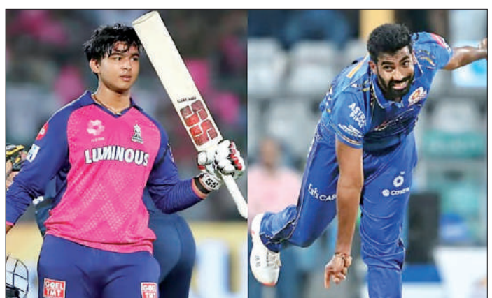
southpaw Suryavanshi fares against Jasprit Bumrah.

Having put bowlers of international repute to the sword, it would be interesting to see how