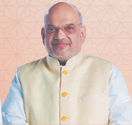
Shri Amit Shah Home Minister & Minister of Cooperation

Upendra Nath Brahma was a visionary leader, revered as Bodofa – the father of the Bodo people. As the proponent of Bodo identity, he inspired a generation with his tireless advocacy for well-being of the community. His legacy extends beyond his lifetime, with his birthday celebrated as Chhatra Divas in Assam, underscoring his profound impact as a student leader.