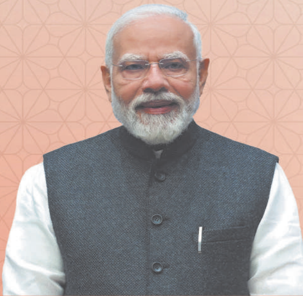
Shri Narendra Modi Prime Minister