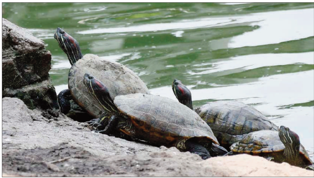
A bale of turtle sits near Jorpukhuri Pond in Guwahati on Monday.

With campaigning now officially concluded, all eyes are set on polling day, as voters prepare to decide the fate of thousands of candidates in what promises to be a closely contested election.