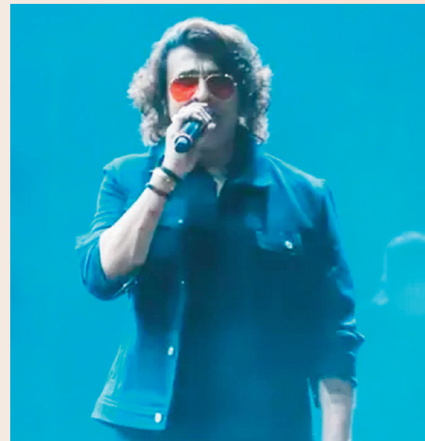
NEW DELHI, May 5: Popular singer Sonu Nigam in a statement on Monday reiterated his love for the Kannada people but felt compelled to confront the young men who "threatened" him during a live concert over language issues.

His statement comes after the Karnataka Film Chamber of Commerce (KFCC) announced a 'non-cooperation' campaign against the singer for his allegedly controversial remark which hurt the sentiments of the Kannadaigas during a recent concert in Bengaluru.