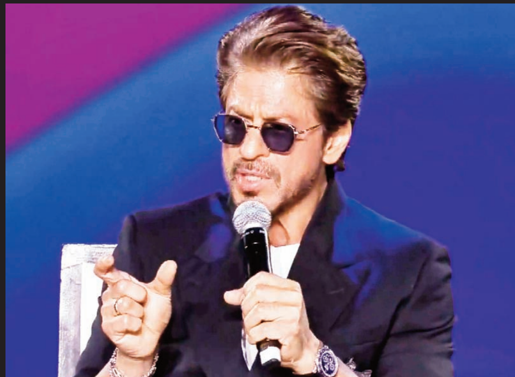
NEW DELHI, May 5: Bollywood superstar Shah Rukh Khan is set to make his debut on the red carpet of the 2025 edition of the Met Gala in an ensemble crafted by fashion designer Sabyasachi.