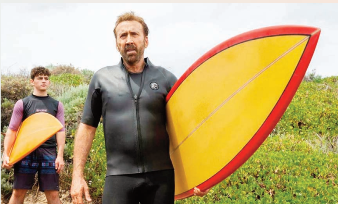
LOS ANGELES, May 5: Hollywood star Nicolas Cage says he "could have died" while training for his film "The Surfer".

Cage said he had a limited time to practice surfing and recalled taking surf lessons before beginning to film in Australia.