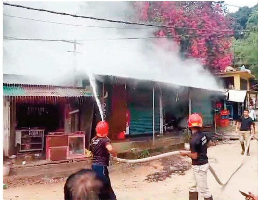
Fire at Kahilpara in Guwahati on Monday Morning.

Panchayat elections are being held in two phases on May 2 and 7 in Assam's 27 districts for the first time after the delimitation of the constituencies. The counting of votes will be held on May 11.