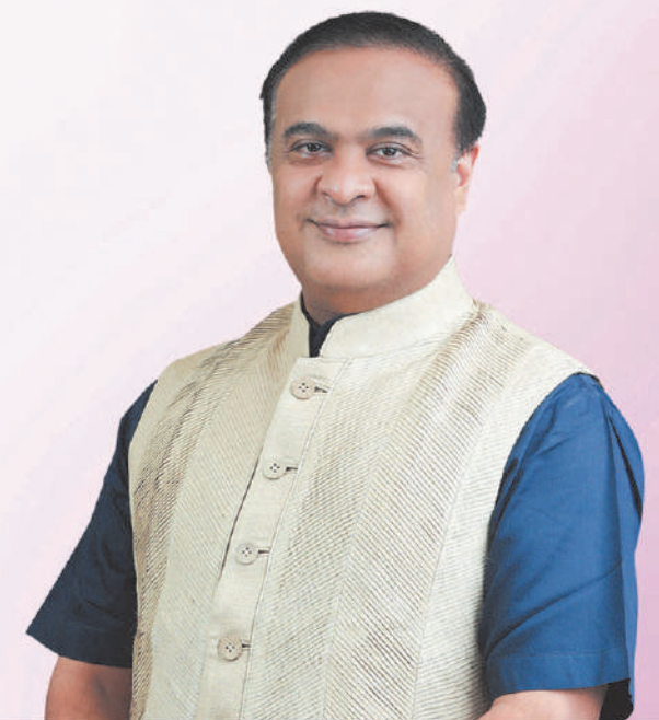
Dr Himanta Biswa Sarma Chief Minister, Assam

through DBT to each eligible woman Self-Help Group member, fuelling entrepreneurship aspirations