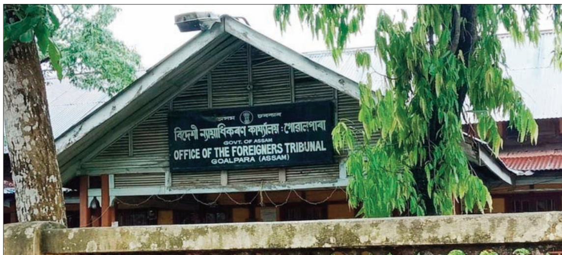
By: Dipak Kurmi

On June 7, 2025, the Assam government, led by Chief Minister Himanta Biswa Sarma, announced a contentious decision to operationalize the Immigrants (Expulsion from Assam) Act, 1950, a colonial-era law aimed at expediting the deportation of individuals identified as "foreigners" by district collectors, circumventing the established Foreigners Tribunals (FTs). This move, which Sarma claims is bolstered by the Supreme Court's October 2024 judgment upholding Section 6A of the Citizenship Act, has sparked a heated debate over the delicate balance between national security and the rule of law. With 330 individuals deported to Bangladesh in May 2025 alone, Assam's aggressive pushback strategy highlights the pressing need to address illegal immigration, yet it raises significant concerns about institutional checks, the rights of vulnerable communities, and the potential for executive overreach in a region marked by a fraught history of migration and identity politics. As Assam approaches the 2026 Assembly elections, the policy's implications—both legal and moral—demand a closer examination, particularly in a state where historical trauma, communal divides, and geopolitical realities converge.