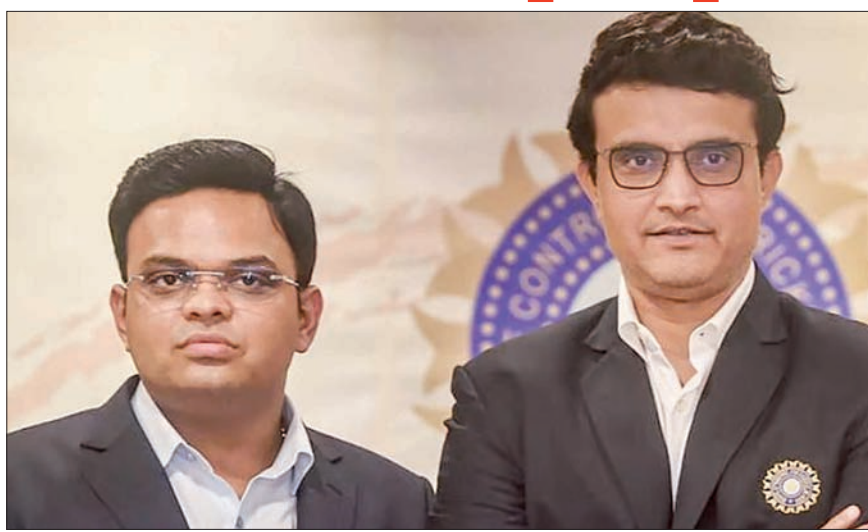
the Gujarat Cricket Association.

It was the first time that both Ganguly and Shah held BCCI positions. Before that, Ganguly had headed the Cricket Association of Bengal, while Shah was an office-bearer in