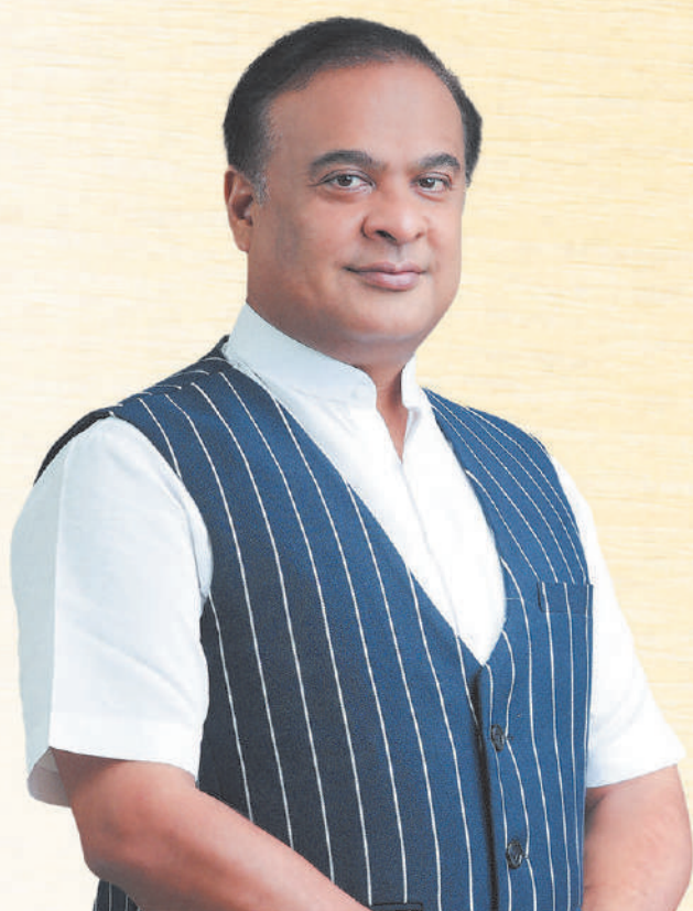
Dr Himanta Biswa Sarma Chief Minister, Assam

Government of Assam Department of Food, Public Distribution and Consumer Affairs