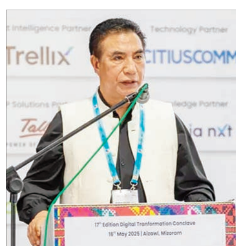
scheme for opening e-offices.

He said the Centre's Department of Administrative Reforms and Public Grievances sanctioned Rs 1.99 crore under the State Collaborative Initiative