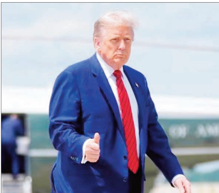
By: Sushil Kutty

President Donald Trump botched up. He had Pakistan by the scruff of its neck and Pakistan recommended his name for the Nobel Peace Prize 2026. Pakistan, the land of wisdom and Islamic valour. But Trump turned against himself and screwed up – he went to war with Iran!