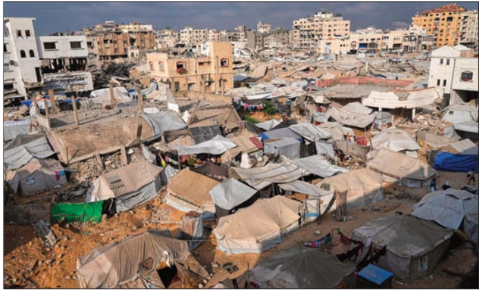
fragile ceasefire was reached.

Some Palestinians in Gaza City expressed frustration Wednesday that the war in the territory has dragged on for nearly two years, while the conflict between Israel and Iran lasted 12 days before a