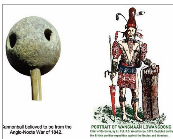
Cannonball believed to be from the Anglo-Nocte War of 1842.