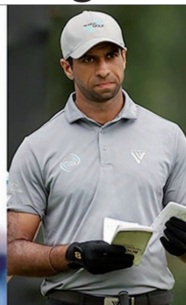
He kept mistakes to a minimum and closed with two birdies for a 68 that put him in a group with the South Korea duo of Si Woo Kim and Sungjae Im.