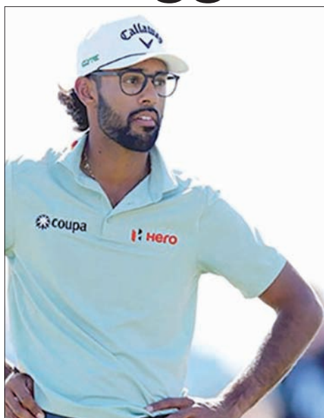
Brooks Koepka, who has not competed in a major since winning the PGA Championship in 2023, he missed the cut in the Masters and PGA Championship this year