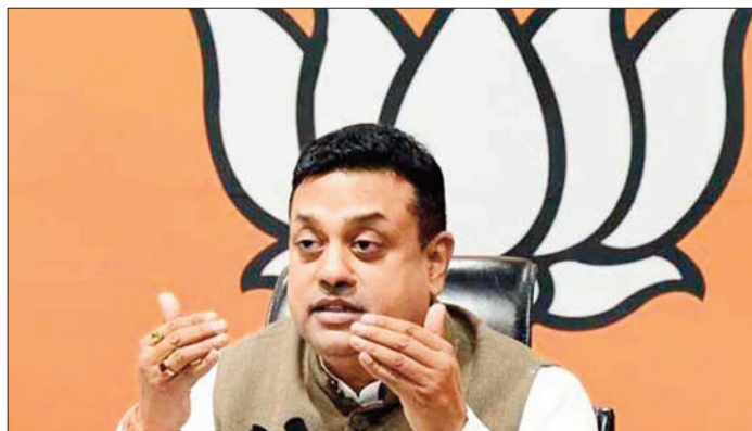
figure for Bengalis in India and for the people of undivided India. This is a direct attack on our shared cultural heritage."