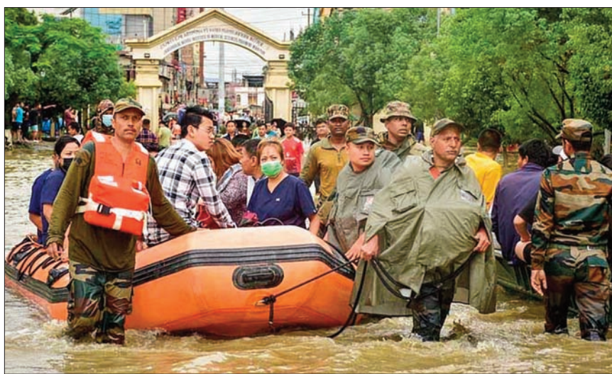
Local clubs, volunteers, SDRF and NDRF personnel joined hands to shift the patients after floodwaters entered the female orthopaedic and surgery wards, located on the ground floor, the official said.

Several patients, who have been undergoing treatment at Jawaharlal Nehru Institute of Medical Sciences at Porompat in Imphal East district, were shifted to other hospitals on Sunday evening as floodwaters entered the premises of the health facility, he said.