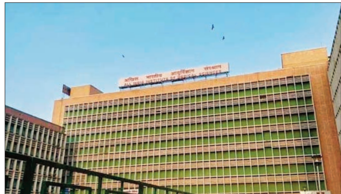
It will also visit the GBP Hospital and Agartala Govt Medical College (AGMC), and discuss with the authorities on how to