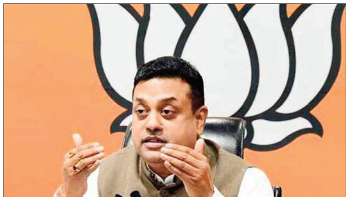
figure for Bengalis in India and for the people of undivided India. This is a direct attack on our shared cultural heritage."