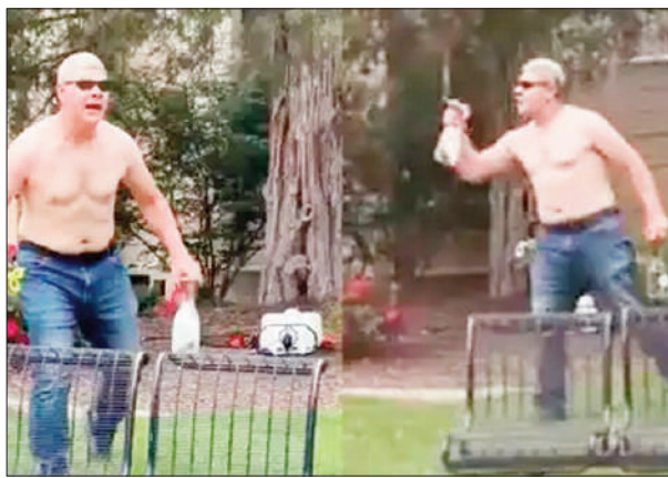
The eight victims who were wounded range in age from 52 to 88 and the injuries spanned from serious to minor, officials said.