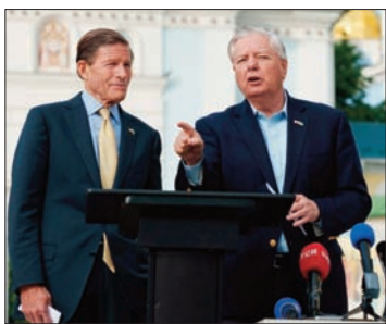
tions proposed in legislation "bone-crushing" and said it would place Russia's economy "on a trade island".

"What I learned on this trip was he's preparing for more war," Graham said of Putin. Blumenthal called the sanc-