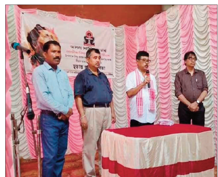
Rabha poetry, captivating the audience with their enthusiastic and heartfelt performances.

More than 100 students from various schools in the Margherita region participated in competitions that included Rabha music, Rabha dance, and recitation of