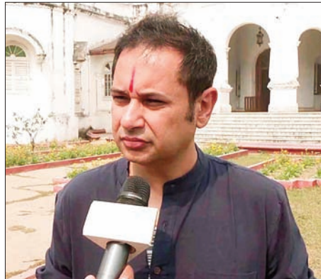
Debbarma said the TMP urged the PM to send a task force to the state.

With this demand, a 15-member delegation of the TMP, led by Debbarma, met Governor N Indrasena Reddy on Saturday night and handed over a memorandum, seeking the PM's intervention.