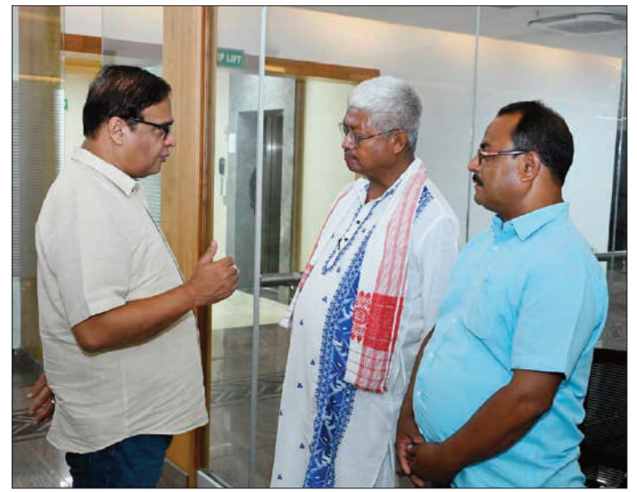
The memorandum highlighted the impact of free textbook distribution on rural bookstores, many of which are shutting down.

Changkakoty's comprehensive appeal, touching upon education, environment, entrepreneurship, and social welfare, was lauded by various quarters as a model of grassroots-focused governance advocacy.