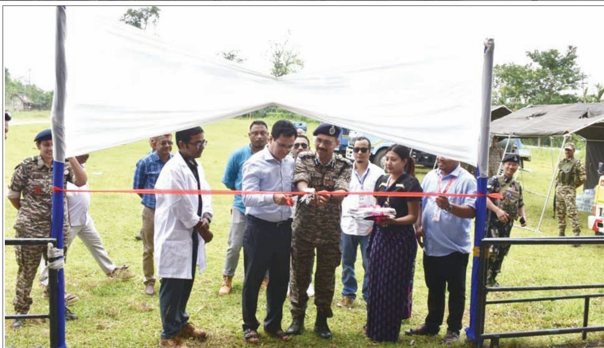
Free health camp organised by The Hills Times in association with Swastha Hospital and CRPF Namsai aiming to uplift rural healthcare infrastructure in the region.