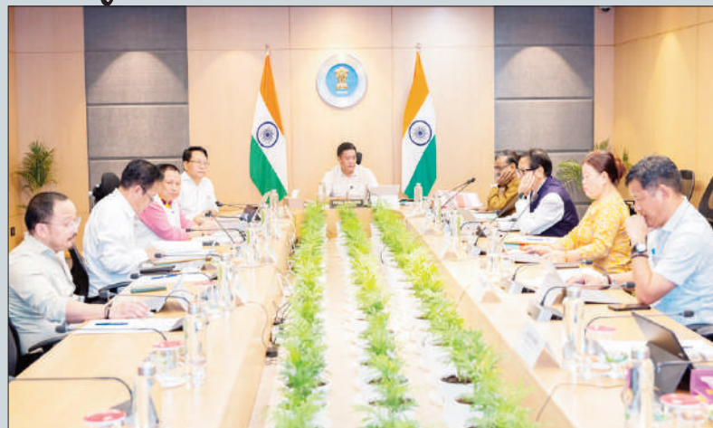
To streamline the allotment of general pool government quarters in the state capital and districts, the cabinet

These guidelines mandate one support person per 10 cases to assist child victims during pre-trial and trial stages, and also detail their qualifications, selection procedures, duties, and responsibilities.