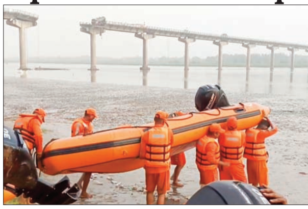
the bridge collapse.

On Thursday, Gujarat Chief Minister Bhupendra Patel suspended four engineers of the state's Roads and Buildings Department in connection with