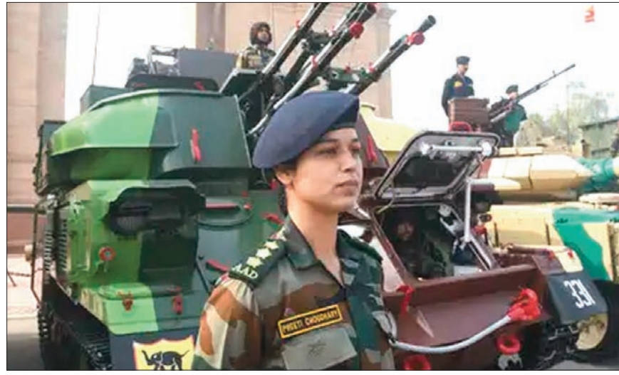
in the Indo-Pacific.

High-level engagement has intensified in recent weeks. External Affairs Minister S. Jaishankar's meetings with US Defence Secretary Pete Hegseth at the Pentagon sent strong signals that both sides understand what's at stake. Carefully worded statements from Washington now suggest "guarded optimism" about resolving the engine impasse in the coming months, ideally ahead of the signing of a new 10-year defence partnership framework. The current roadmap, due to expire in 2025, is set to be replaced with a broader vision for defence co-production, logistics cooperation, resilient supply chains, and joint research — a foundation both governments are pitching as vital to 21st-century security architecture