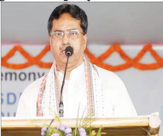
Asserting that government jobs were not the only solution, he said his government is also focusing

Saha made the statement while addressing a programme where he handed appointment letters to 184 newly hired junior engineers. He said, additionally, contractual and outsourcing appointments were made, and that figure could be around 8,000.