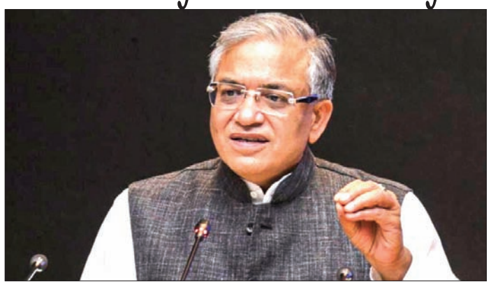
tered in Delhi, not in Patna."

Addressing a group of booth-level officers here, the CEC said, "As per the Representation of the People Act, you are entitled to vote only in the assembly constituency where you are an ordinary resident. For example, if you ordinarily reside in Delhi but own a house in Patna, your vote should be regis-