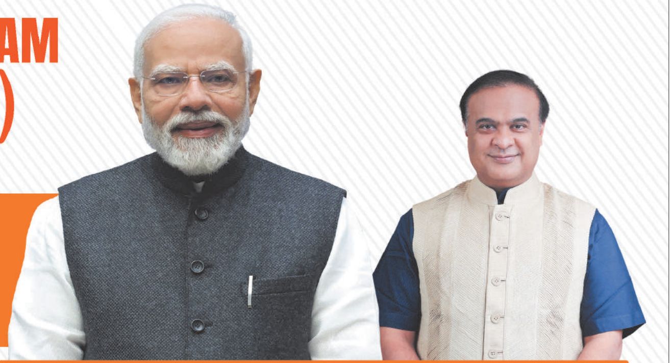
Shri Narendra Modi Prime Minister

A flagship initiative under PM's leadership