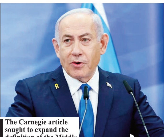
The Carnegie article sought to expand the definition of the Middle East beyond the traditional Middle East and North Africa, reaching as far as the Caucasus and Central Asia

Between then and now, Iran has remained his primary focus, even as regional alliances began to form around a discourse of stabilization and renewed diplomatic ties.