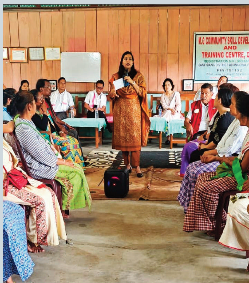
Following her visit to Oyan, the Deputy Commissioner inspected the Government Sericulture Farm at Sille, also under Ruksin Sub-Division, where she inter-

She also called for more robust linkages with online platforms to enable wider access to consumers. Highlighting the role of collective strength, she encouraged the formation of additional cooperative societies to support both textile weavers and sericulture farmers in the region.