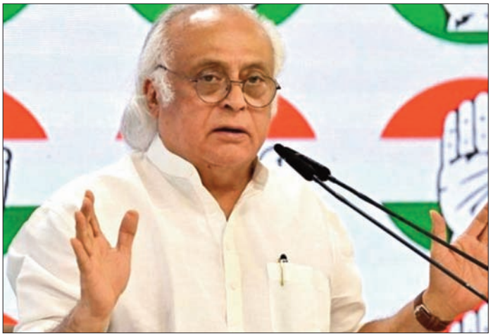
ANAND (GUJARAT), July 6: Union minister Amit Shah on Sunday urged cooperative sector leaders to make transparency, use of technology, and the interest of its members high up in their "work culture" to achieve success.

"As a lower middle-income country, the appropriate rate to measure poverty in India is that of USD 3.65/day. By this measure, the poverty rate for India in 2022 is significantly higher at 28.1 per cent," Ramesh said, citing the report. "The report is therefore rather