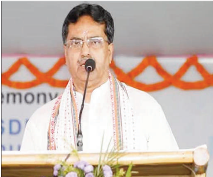
Asserting that government jobs were not the only solution, he said his government is also focusing on making the youth self-reliant. "The number of Self Help Groups (SHGs) has been in-

Saha made the statement while addressing a programme where he handed appointment letters to 184 newly hired junior engineers. He said, additionally, contractual and outsourcing appointments were made, and that figure could be around 8,000.