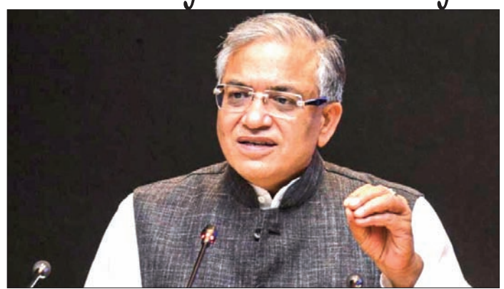
tered in Delhi, not in Patna."

Addressing a group of booth-level officers here, the CEC said, "As per the Representation of the People Act, you are entitled to vote only in the assembly constituency where you are an ordinary resident. For example, if you ordinarily reside in Delhi but own a house in Patna, your vote should be regis-