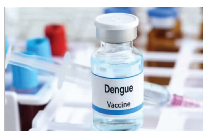
(PGIMS), Rohtak last year.

The first participant in this trial was vaccinated at the Pandit Bhagwat Dayal Sharma Post Graduate Institute of Medical Sciences