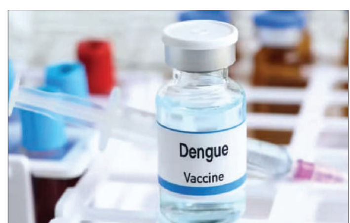
(PGIMS), Rohtak last year.

The first participant in this trial was vaccinated at the Pandit Bhagwat Dayal Sharma Post Graduate Institute of Medical Sciences