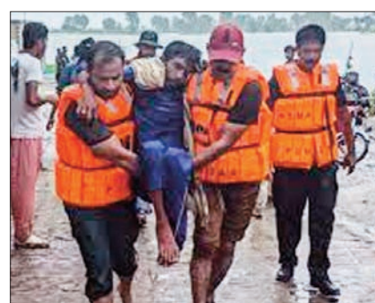
"Over 175,000 people left their houses on their own, while 25,000 people, who were stuck in flood-hit areas, have been rescued through boats by the government rescue agencies," the official said.

A senior official of Punjab Emergency Services told PTI on Tuesday that nearly 200,000 people have been evacuated from Kasur, Okara, Pakpattan, Bahawalnagar, Vehari, Layyah, Bhakkar and Narowal.