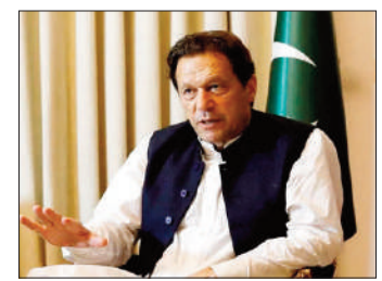
jab chief minister, even his basic rights as a prisoner are being violated. There is no light in the cell, and my family members are also being denied visitation rights," Khan said.