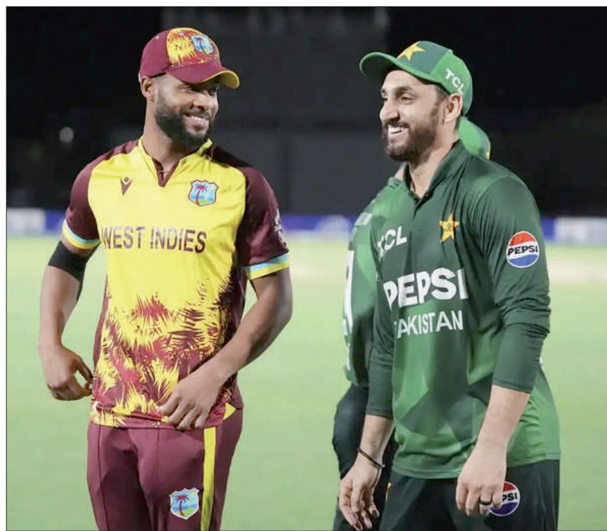
After losing eight straight matches to Australia and then losing a Twenty20 series 2-1 to Pakistan in Florida, West Indies lost the ODI series-opener to Pakistan last week by five wickets. West Indies leveled the series with a five-wicket victory in the second ODI to stoke hope of a revival and dominated the third.

The summit was called after a West Indian lineup scored just 27 runs in its second innings — one run short of the all-time test record for low totals — while losing the third of three tests to Australia.