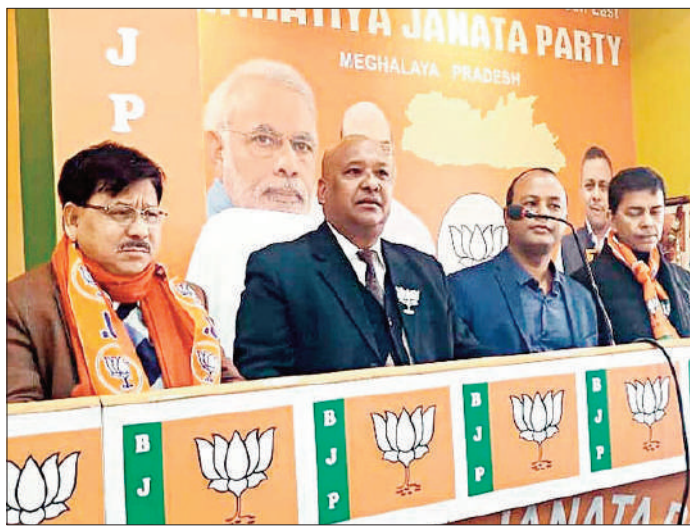
listed the OBC castes of Meghalaya; consequently the OBC community residing in the state stands

Pohshna has reminded everyone that the government has not yet