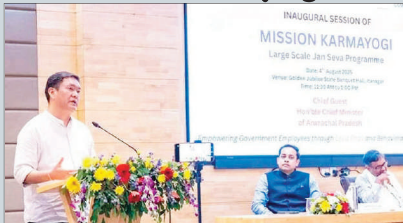
ITANAGAR, Aug 4: Arunachal Pradesh Chief Minister Pema Khandu on Monday described Mission Karmayogi as a transformative movement rather than just a training programme. Addressing officials from the state

and Tripura, Khandu described Mission Karmayogi as more than just a training programme.