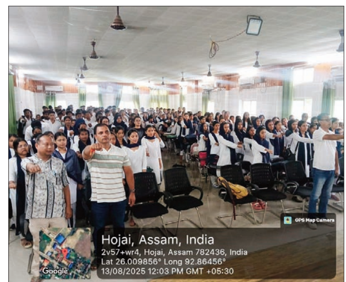
Hojai, Assam, India 2v57+wr4, Hojai, Assam 782436, India Lat 26.009856° Long 92.86456° 13/08/2025 12:03 PM GMT +05:30