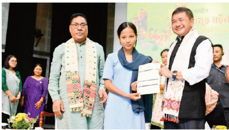
Anglong have been identified as eligible beneficiaries.

As per an official data, 2,501 students from 23 schools and 1,683 students from 11 colleges in Karbi Anglong, and 633 students from 10 schools in West Karbi