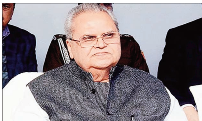
he was posted to Meghalaya, his final assignment. On retirement from governorship, he publicly confronted the central govern-

From J-K, he had been relocated to Goa, where his relationship with the state government soured as he was openly critical of its COVID-19 response and accused it of corruption. His term in Goa came to an abrupt halt and