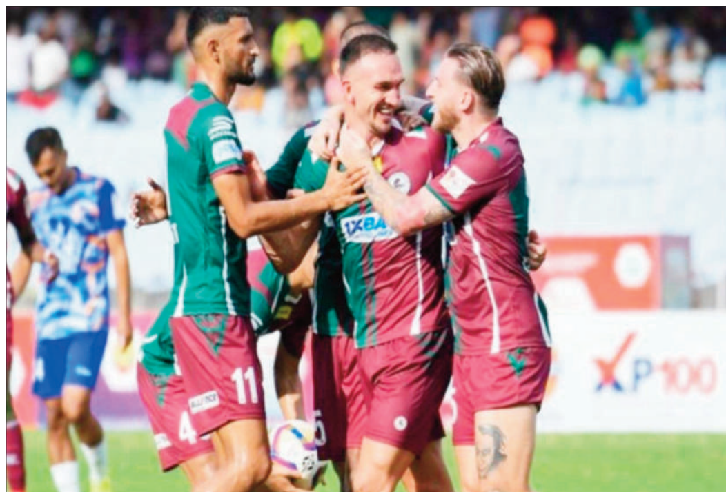
Derby bragging rights.

That debate is now behind, and all eyes will be on the action as both teams prepare to battle for the