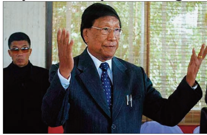
Th Muivah, general secretary of NSCN (IM), speaking at a podium.

He said the political space and opportunity given by the Indo-Naga political peace process and the signing of these two agreements must be harvested to con-