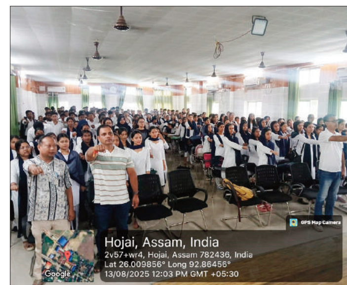
Hojai, Assam, India 26.009856° N, 92.88456° E 13/08/2025 12:03 PM GMT +05:30