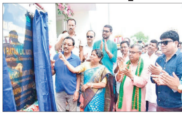
Minister Ratan Lal Nath inaugurating the 33 kV Durga Chowmuhani Sub-station.

The Minister said that the power department is now thinking of new and innovative ideas for the development of the power sector.